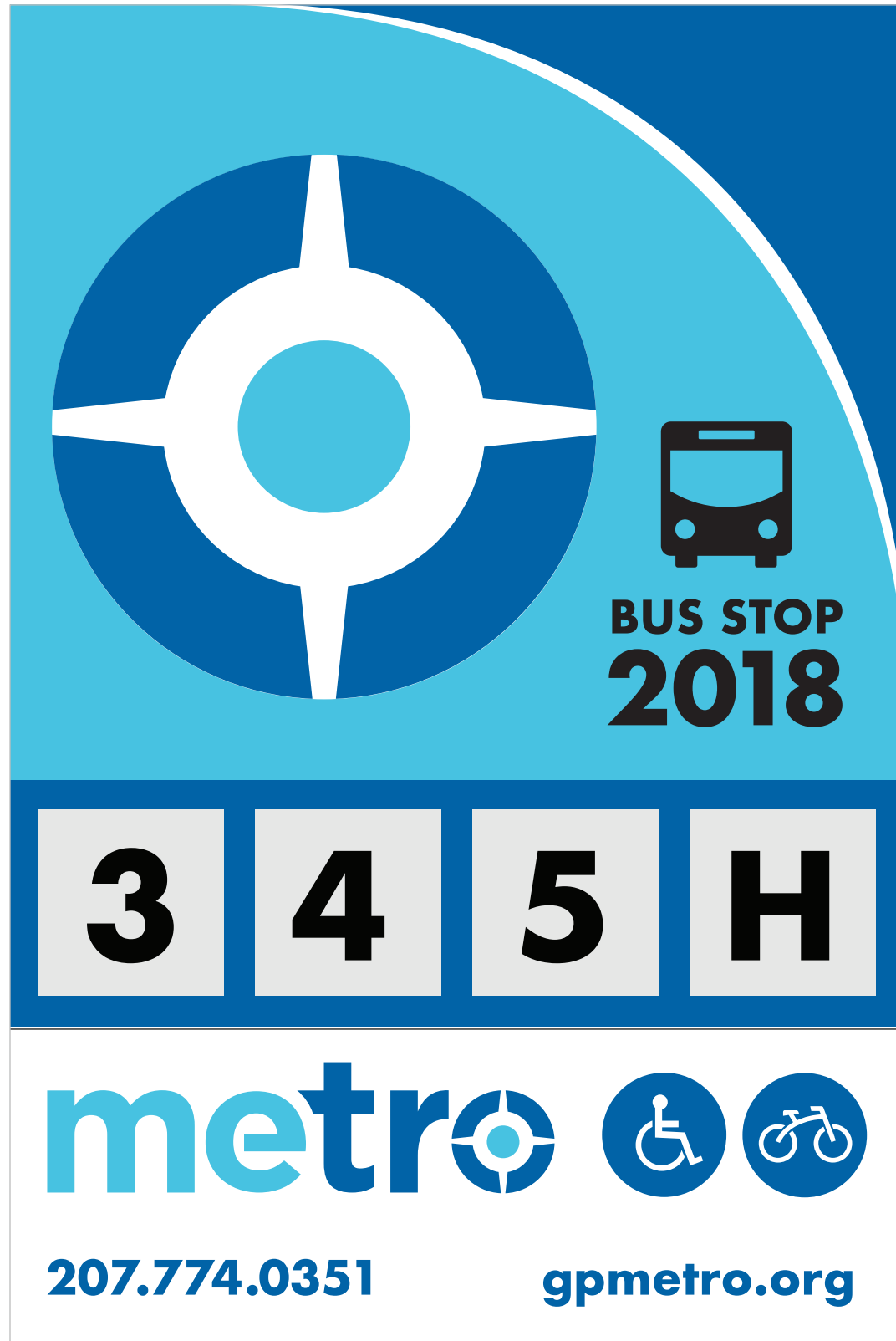
BUS STOP SIGN